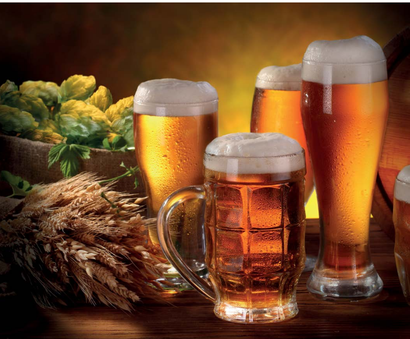
Figure I.1: The ingredients of fermented beverages combine in harmonious ways to produce a full-spectrum flavor experience.

Here is where the concept of full-spectrum fermentation comes into play. Using a technique of flavor component selection and complete understanding of flavor perception, the umami artist can be confident in bringing to life an inner vision and the relaxed savoring of a job well done.