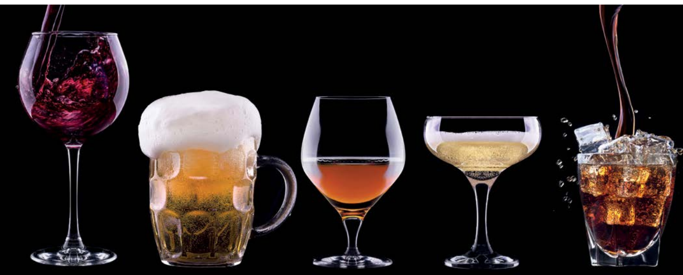
Figure 1.3: Fermented beverages create a full-spectrum impact of sight, smell, and sound.