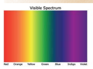
Figure 1.1: The visible spectrum shows smooth transitions from one color to the next.

This does not suggest that, as with white light, all of the values are present in equal quantities in all the spectra that form the experience of a good fermented beverage, but all of them are nonetheless there to one extent or another if it is to be called full-spectrum.