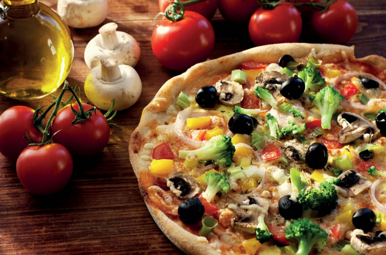
Figure 1.4: Pizza is loaded with umami ingredients: tomatoes, mushrooms, meat, and parmesan cheese. Five taste sensations combine to produce a mouth filling experience.

inoculation, or occasionally, the addition of acidic juices. Because the growth of the organisms responsible for sourness in fermentations can be hard to control, sourness in most other fermentations is considered a fault.