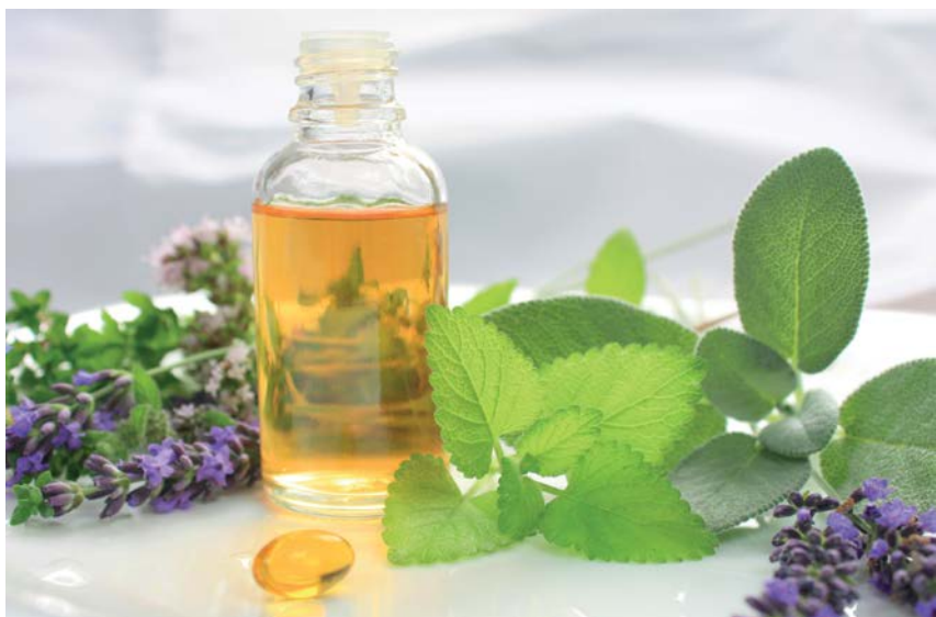
Figure 1.5: Aromatic compounds in herbs and other ingredients combine with their tastes to create the impression of “flavor.”

The most prominent among the aromas wafting from a fermented beverage are those that arise from the herbal component of its recipe. In addition, and sometimes dominating, malts contribute grainy-sweet aromatics, fruits contribute their distinctive smells, and yeasts offer crispness and fruitiness.