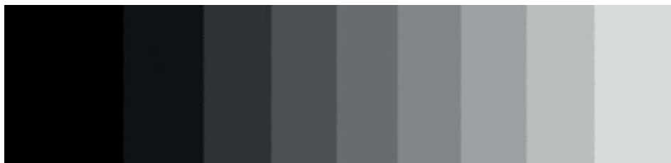
Figure 1.2: A full-spectrum gray scale contains tones from pure white to pure black. By Tomás Castelazo (Own work) [CC-BY-SA-2.5 ( http://creativecommons.org/licenses/by-sa/2.5/ )], via Wikimedia Commons

Let's break the question down so that a single spectrum is analyzed as to what it means to have spectral balance. Consider the black and white photograph. The trick to making photographs render a vivid sense of reality in black and white, is to make sure that a print presents a full visual world that includes a complete range of tones from pure white to pure black.