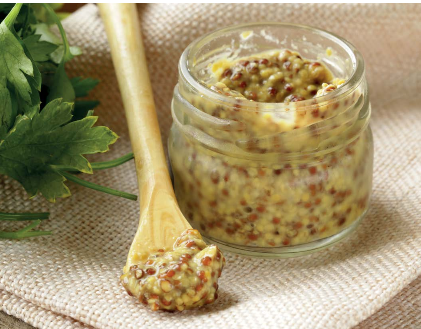
Figure 1.6: Artisanal mustard has a much more complex flavor, with ingredients such as wine and herbs.

So can crafted brew. The next chapters will discuss how the principles of full-spectrum fermentation are applied to create that sensory balance crucial to a memorable imbibing experience.